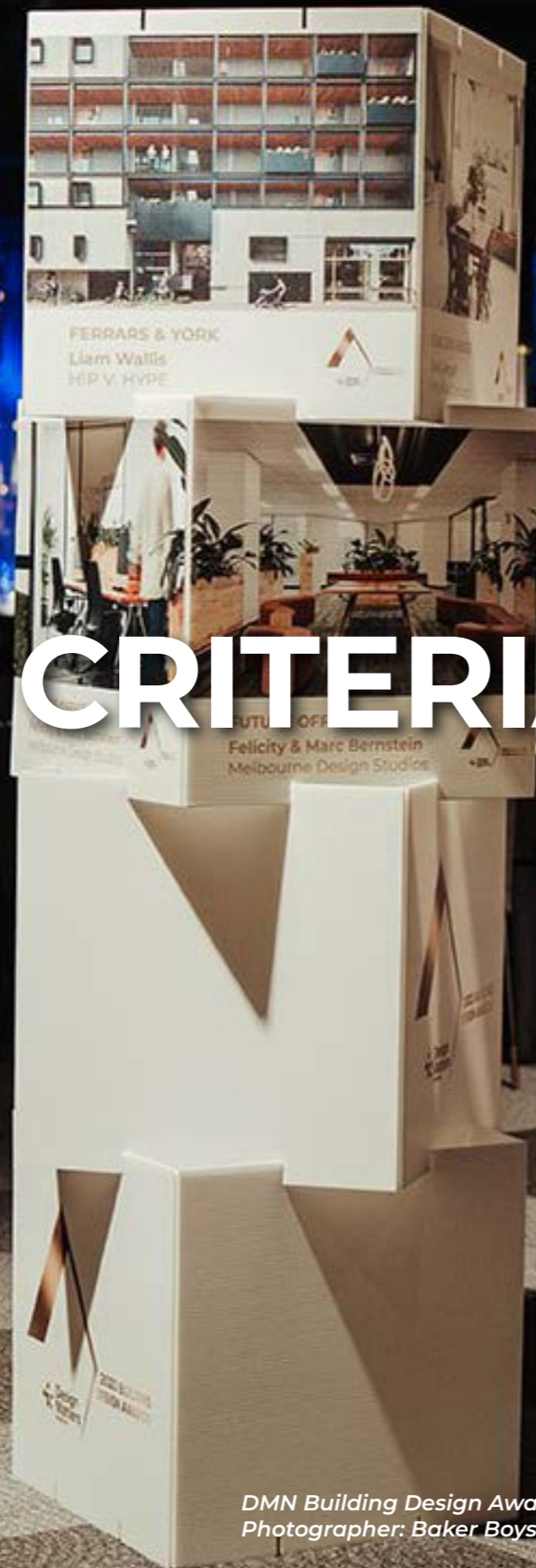
DMN Building Design Awards 2023